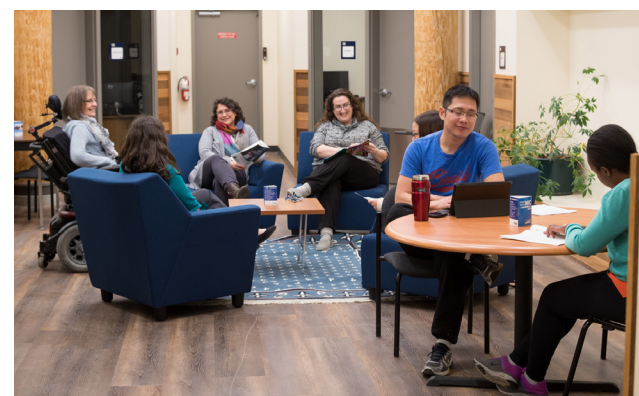
NIC's new $1.4 million campus at Thunderbird Mall features a welcoming student lounge and a dedicated interactive TV classroom. The new campus is closer to NIC's community partners and more accessible for students walking or busing to campus.

"It's exciting to be educating tourism students in a space that reflects our location, both environmentally and culturally," said Hartnett.