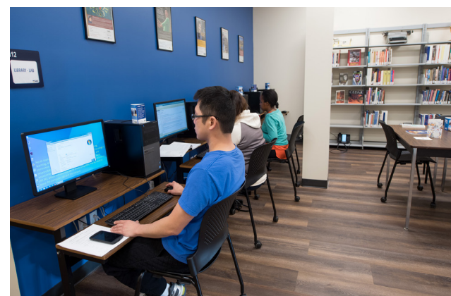
Students at NIC's new campus at Thunderbird Mall have access to a wide range of resources such as quiet study and meeting spaces, writing, math, research and technical support to help them succeed.