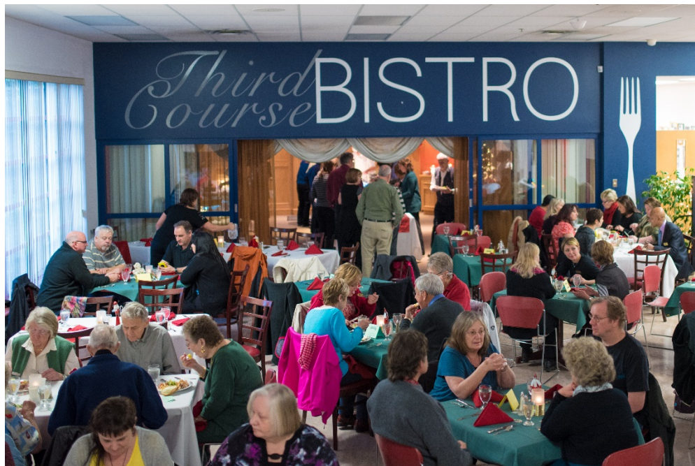
Admin, staff, and stakeholders enjoy the Culinary Christmas Buffet