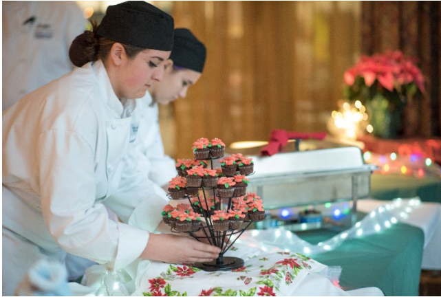
Students prepare the dessert table