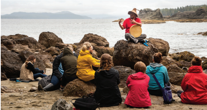
BSN students learning through Huu-ay-aht story telling at Kix̱in ancient village site.

The Raising Student Nurses in Remote First Nations Communities (RSN) project continues to learn from the successful provision of immersion learning opportunities early in the nursing curriculum.