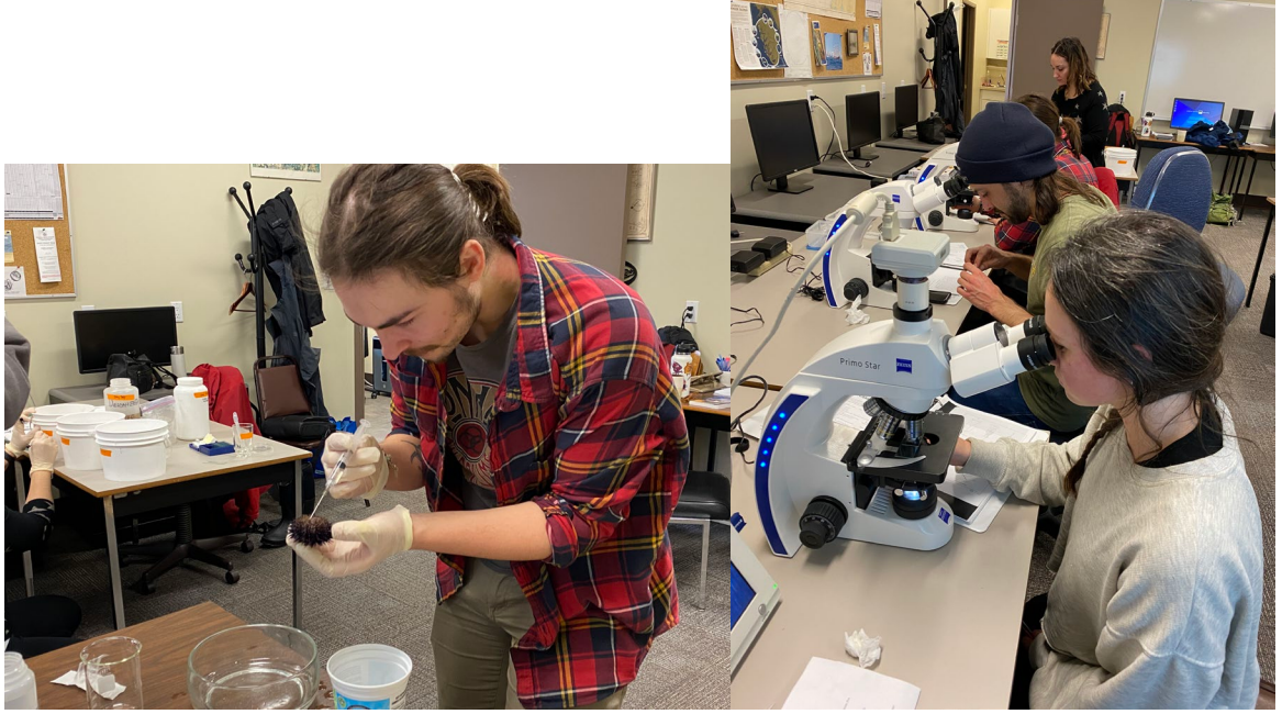
Collecting urchin gametes and observing embryonic development under the microscope.