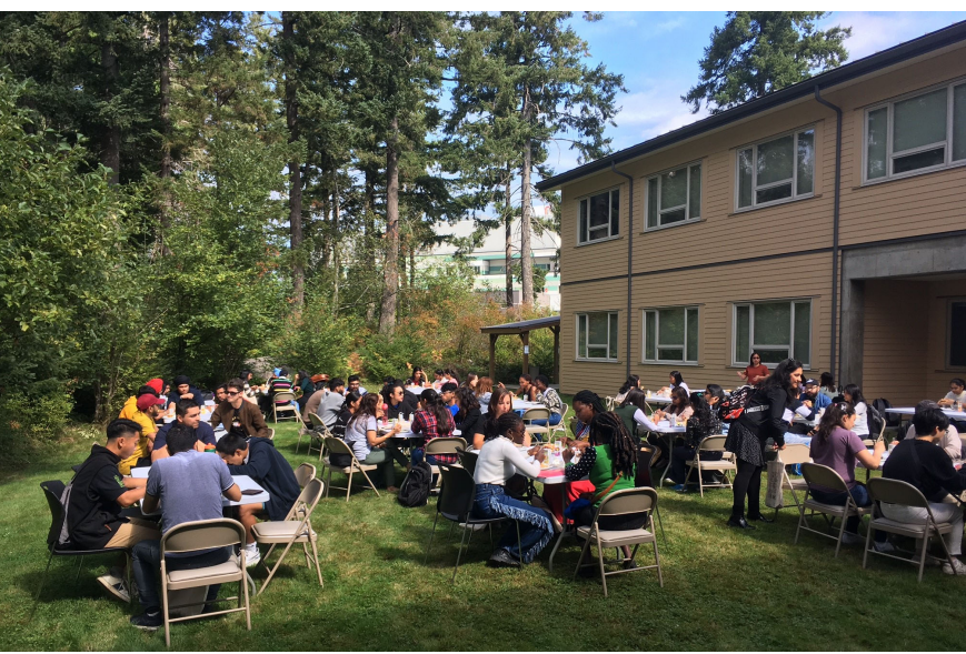
Comox Valley Fall 2023 International Students lunch behind Tyee Hall

Campbell River Fall 2023 International Students group photo outside of the Qapix?ida?as (Gathering Place)