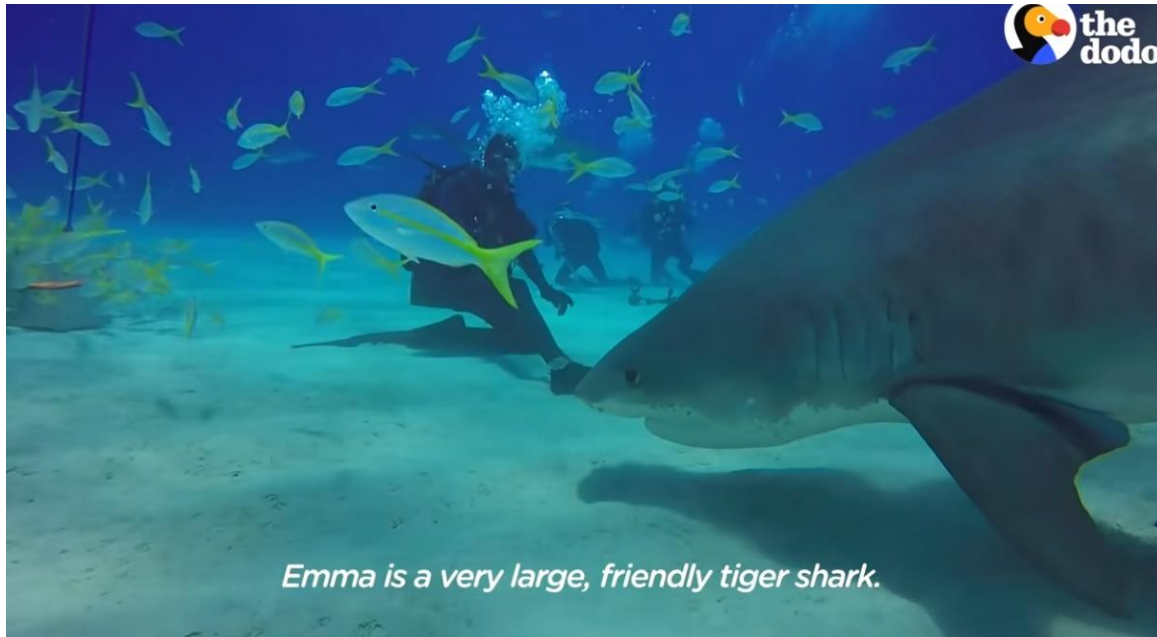
Emma is a very large, friendly tiger shark.

Perhaps you are more interested in dancing? This video mixes various stars dancing their hearts out in the movies.