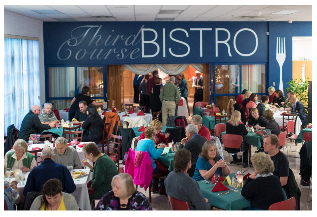
Admin, staff, and stakeholders enjoy the Culinary Christmas Buffet