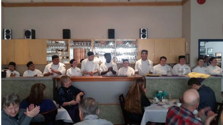
Culinary students take a bow to an appreciative crowd in the CR Bistro