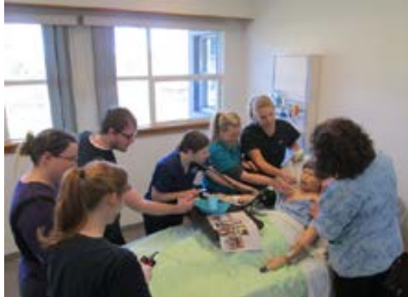
Nursing students use an Unfolding Case Study as contextual learning.