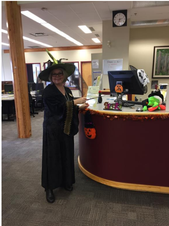
Port Alberni Campus