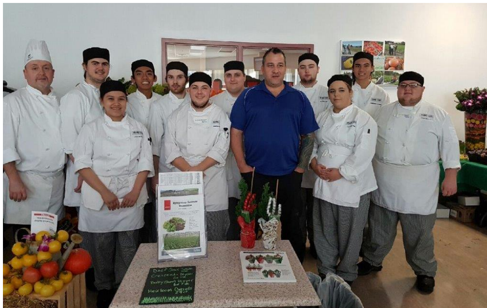
Sysco Food Show, November 9, 2016