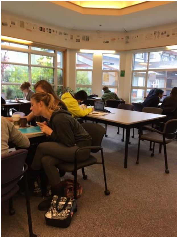
Group space – CV LLC

As we near the completion of Phase 1 with new branding, updated signage, services and space, we are celebrating on November 10 th , November 17 th and November 23 rd at PA, CR and CV respectively. We are inviting the entire college community to join us for cupcakes over the lunch hour to showcase and talk about the services of the LLC.