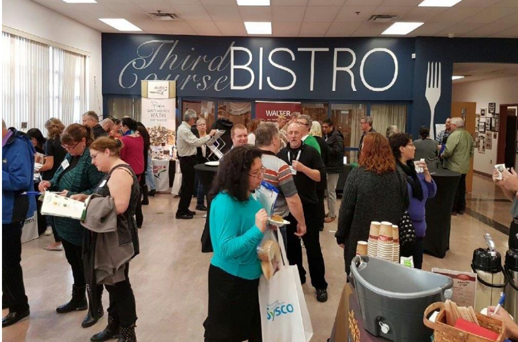
Sysco Food Show, November 9, 2016

The Campbell River campus welcomed over 100 culinary industry representatives and suppliers who participated in the Sysco Food show on November 9 th . The event was a great success! The Food Show provided an opportunity for North Island College Culinary students to present a menu of amazing meals prepared with Sysco products. Student engaged with employers, networked with industry representatives and suppliers and had the opportunity to apply their impressive culinary skills and job search techniques.