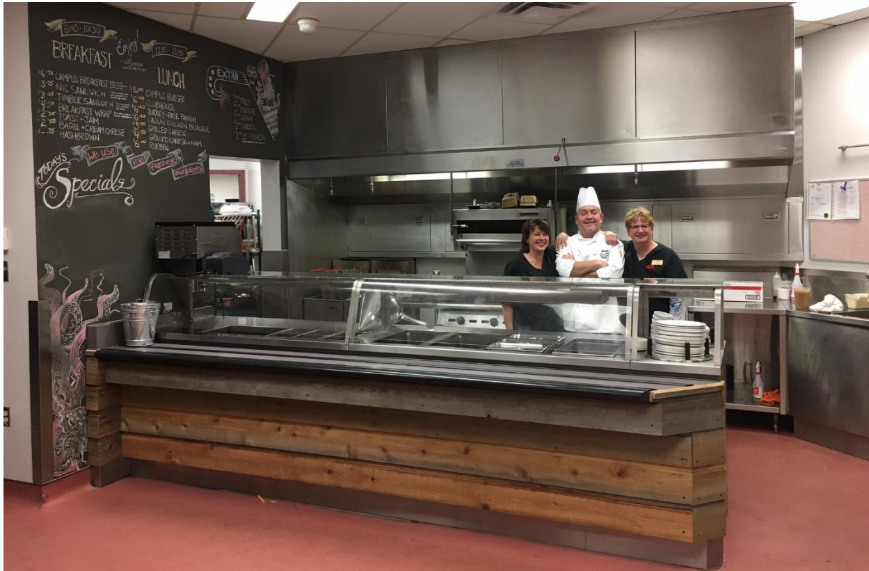
Campbell River Cafeteria

The Campbell River cafeteria is doing very well this semester having gone through a menu adjustment and an update of the service space and image.