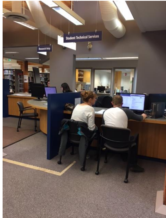
Lending, Research and Student Technical Services