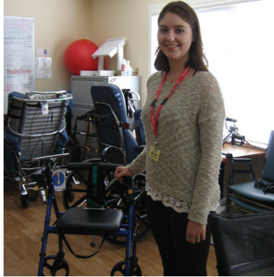
Student volunteering at Yucalta Lodge