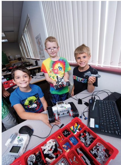
Students learning valuable Science, Technology, Engineering and Math (STEM) skills at the Campbell River Lego Robotics camp this summer.