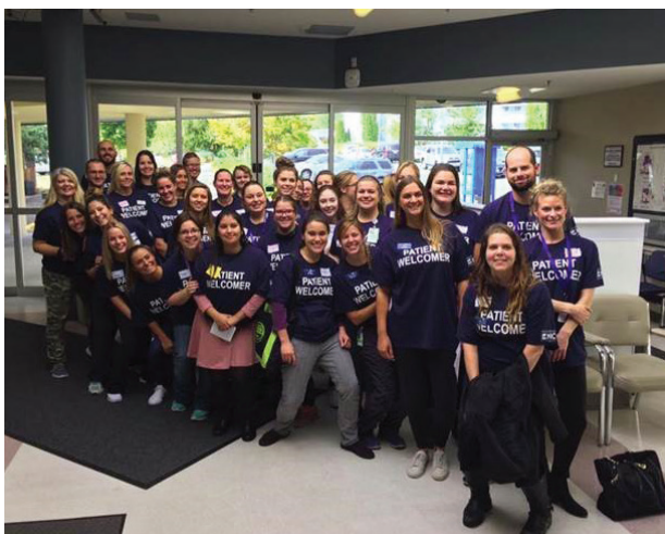
NIC’s nursing students assisting in the patient move to the new Comox Valley Hospital.

A team of 48 students in North Island College’s Licensed Practical Nursing and Bachelor of Science in Nursing programs supported more than 90 patients who moved from St. Joseph’s General Hospital to the new Comox Valley Hospital. Island Health said it was grateful for the positive energy and additional support of their amazing nursing colleagues.