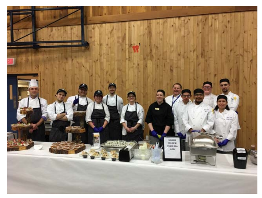
Campbell River Prep Cook students join Port Alberni Culinary Professional Cook Level One students for a Community Taste Event in Port Alberni on Friday, March 2<sup>nd</sup>.

Students celebrate program completion in March with a Spring Buffet in Campbell River! The program was launched in November and students have been engaged in expanding core competencies aligned with entry level culinary positions.