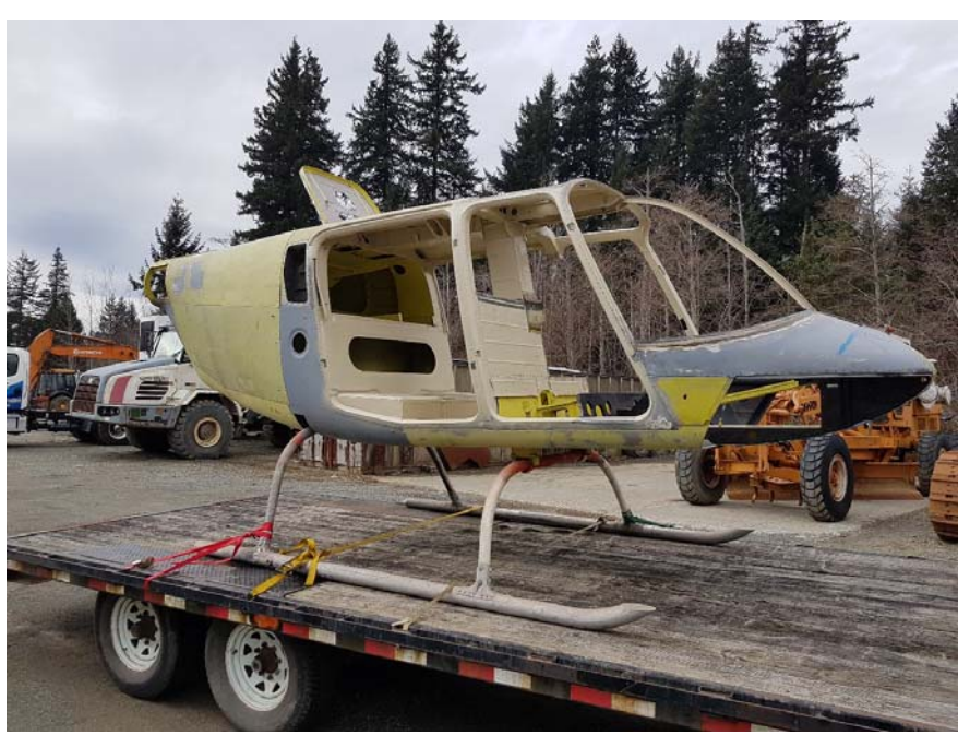
Fuselage section of Bell 206 Jet Ranger helicopter donated by E&B Helicopters