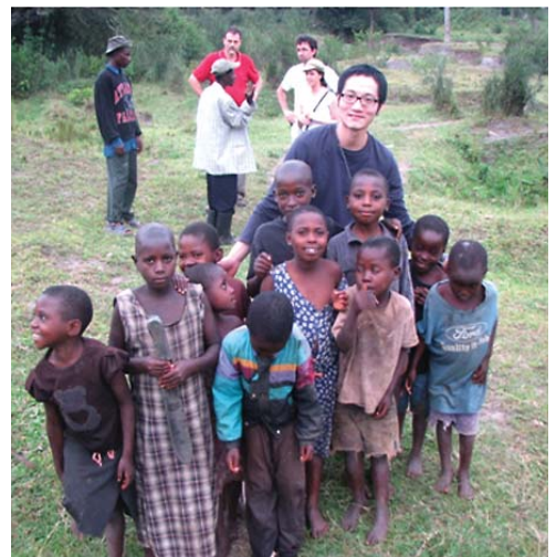
Explore how to apply your skills in an international setting.